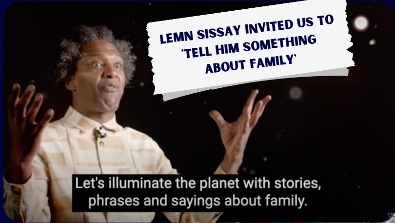
LEMN SISSAY INVITED US TO 'TELL HIM SOMETHING ABOUT FAMILY'

Let's illuminate the planet with stories, phrases and sayings about family.